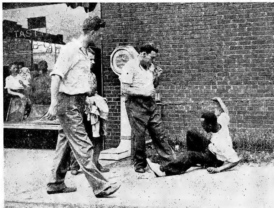
Using gutter fighting tactics of Hitler's mobsters against unionists and Jews in Germany, three Detroit hoodlums assault lone Negro. Man on ground clutches glasses in left hand. Note ring leader smoking cigarette.